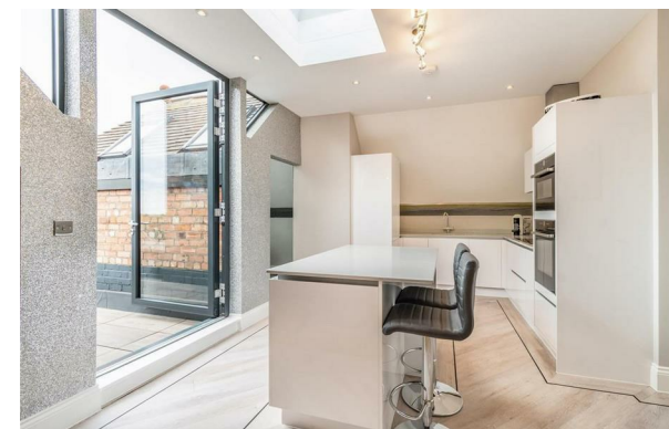
Woodlands Apartment 15 6 Willow Road Bournville, Guide Price £600,000